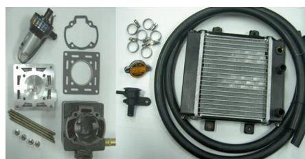
Dio 54mm water cooler cylinder kit( 94.8cc )